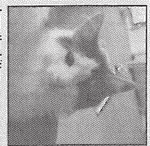
Jerry the kitten.